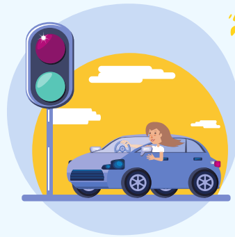
Violating traffic light