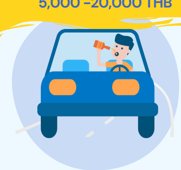
Drunk driving **2 years in jail and a fine of 20,000 - 100,000 baht if the same offense repeat

1 year in jail and/or a fine of 5,000 -20,000 THB