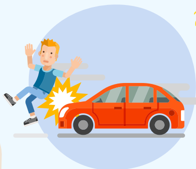
Driving regardless others' safety