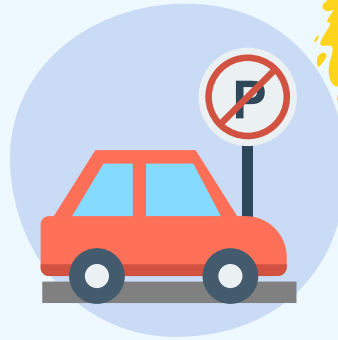
Parking in prohibited area