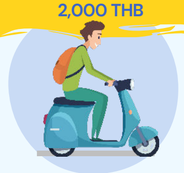
Not wearing a helmet