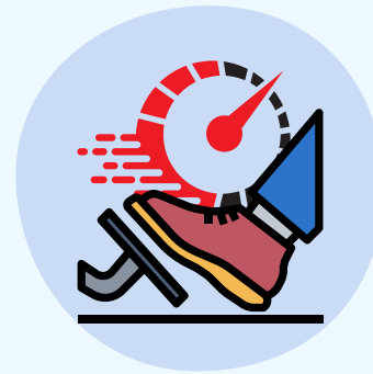
Driving at speed exceeding the legal limit

Although the new traffic law took effect on September 5, police have decided to be lenient for the first three months to give people time to adjust or improve their road behavior.