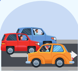
Driving against the flow of traffic

Increase the penalty to enforce and ensure road safety with effect from September 5, 2022