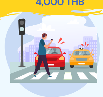
Failing to stop at a pedestrian crossing